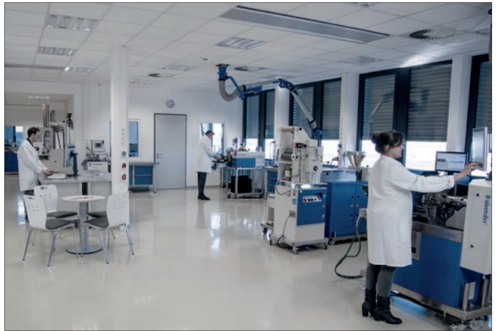
Brabender application laboratory

You can choose to send material to us for testing or schedule a specific Lab Trial with our expert team. In our application laboratory, you will have access to our full product line to help come to a solution for your application.