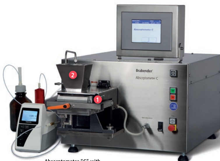
Absorptometer "C" with mixer for testing silica or other free flowing materials