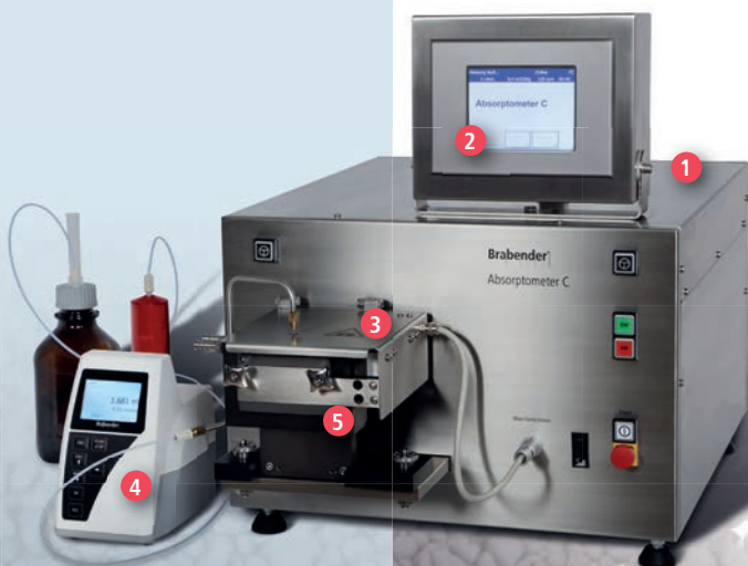
Absorptometer "C" with mixer for testing carbon black